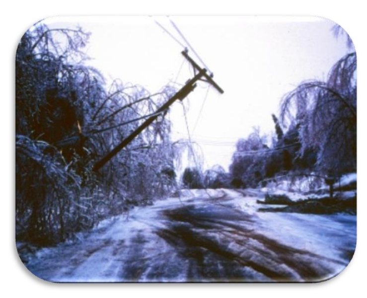
No power does not mean no water. Get a Bison Pump today!